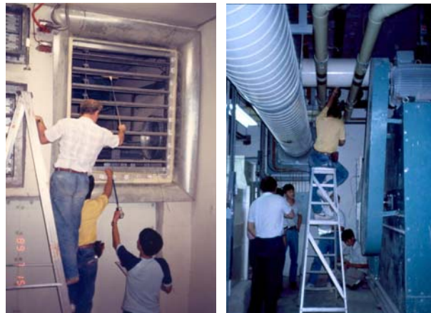
Measuring Air Quantities at Intake Air Plenum