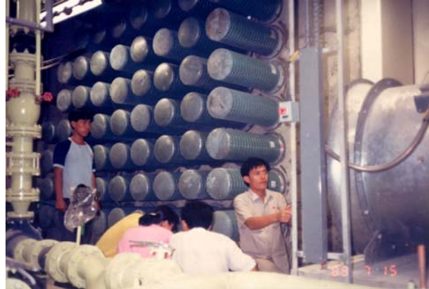
Commissioning of an EC System

Advising the specialist MVAC Engineers in the detail design of the systems and supervising installation and commissioning, as well as establishing operation and maintenance manuals has been among Heierli Consulting Engineers' scope of works